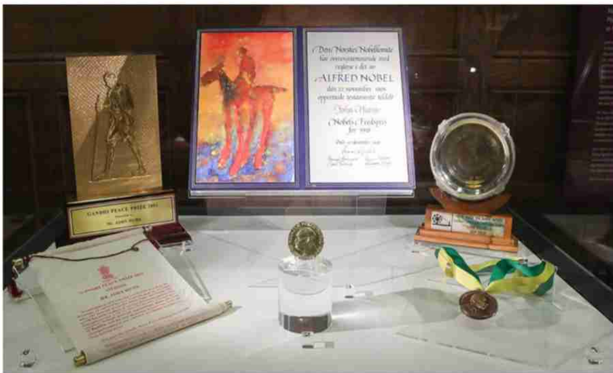
John Hume Peace Prizes Collection.