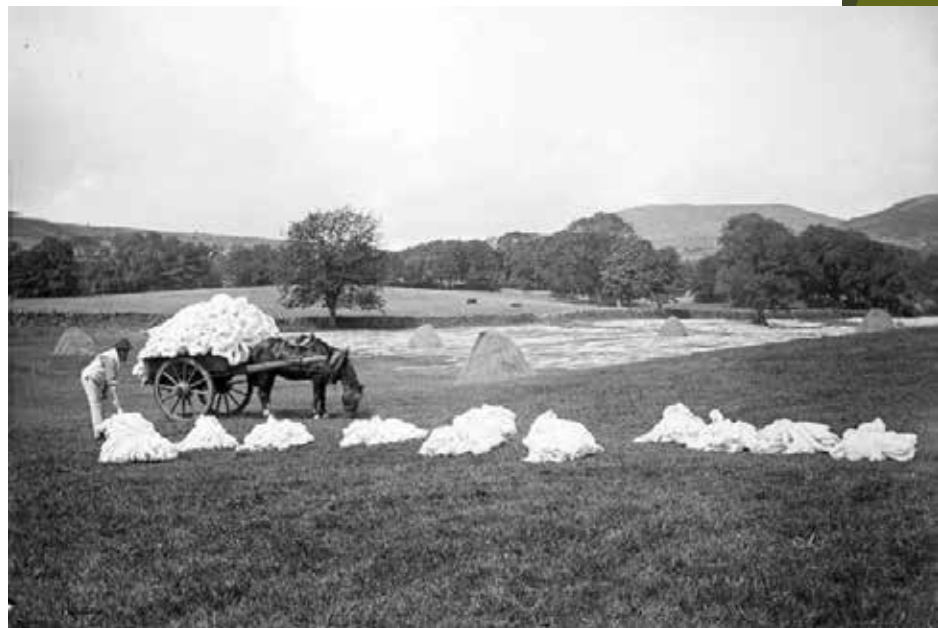
Flax growers in County Down, c.1890