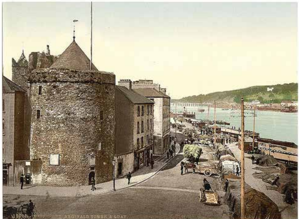
Reginald's Tower, Waterford, early twentieth century

Many more records are expected shortly, including the Roman Catholic registers for the parishes of Camolin and Adamstown, County Wexford, so keep your eyes open for more updates! We will notify those on our mailing list when these records are uploaded and available, so make sure to register to our mailing list to keep abreast with new additions to www.rootsireland.ie !