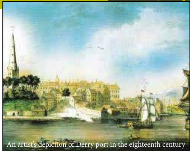
An artist's depiction of Derry port in the eighteenth century