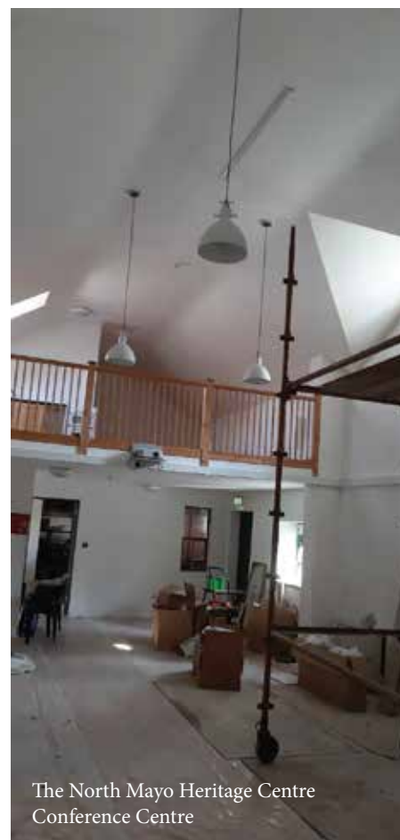
The North Mayo Heritage Centre Conference Centre

The redevelopment of the Conference Centre, set in the magnificent gardens and grounds of Enniscoe House, will provide self-contained meeting facilities for up to eighty delegates with breakout meeting rooms and accommodation. The North Mayo Heritage Centre, now a proven economic driver in the region, is dedicated to preserving and promoting the rich heritage of the region and this redevelopment of the Conference Centre will allow them to extend that even further.