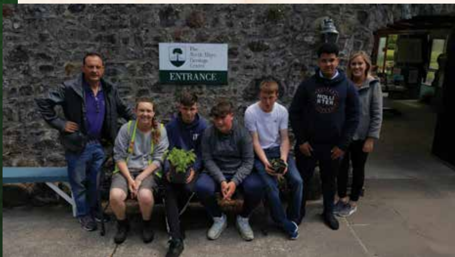
A group from St Gerald's College, Castlebar, who piloted the new tour

As visitor numbers continue to climb at the North Mayo Heritage Centre, the manager and staff have been working on the design and delivery of a tour which will include the centre, gardens, looped walk and Enniscoe House. The tour has been successfully piloted during May and June and will be taking place daily during July and August.