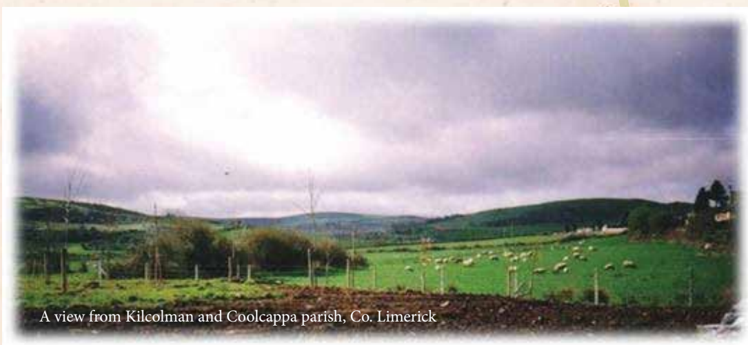
A view from Kilcolman and Coolcappa parish, Co. Limerick