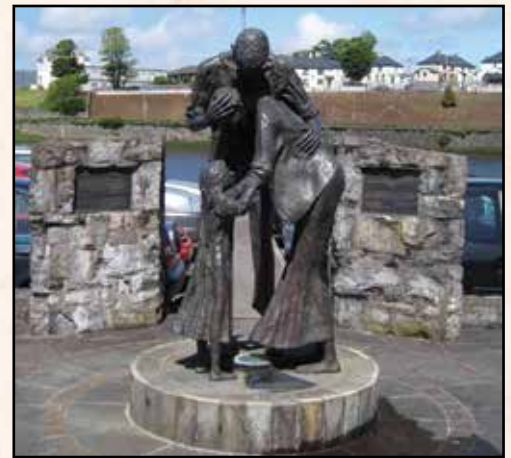
Famine Family Monument at Sligo Harbour

is likely to be of interest to those with Irish ancestry, wishing to find out more about the history of trans-Atlantic emigration. It will also appeal to those travelling the increasingly popular Wild Atlantic Way driving route. The fifteen-minute feature is available to view on request in County Sligo Heritage & Genealogy Centre in Temple Street, Sligo during normal office opening hours. Ph: +353 71 9143728; Email: manager@sligoroots.com