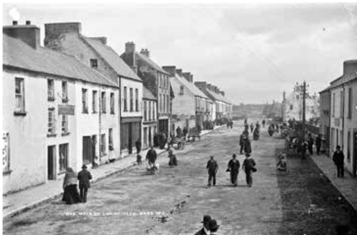
Cahirciveen, County Kerry

To search these records, go to www.rootsireland.ie/kerry .