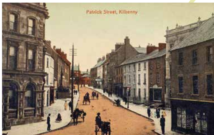
Patrick Street, Kilkenny

This means that over 200,000 records were uploaded in 2019. Many more records are expected in 2020 from Limerick, Offaly, Cavan, Westmeath and Wexford, so keep your eyes open for more updates, including some very exciting news which we can't wait to share with everybody about a new set of records! We will notify those on our mailing list when all of these records are uploaded and available, so make sure to register to our mailing list to keep abreast with new additions to www.rootsireland.ie !!