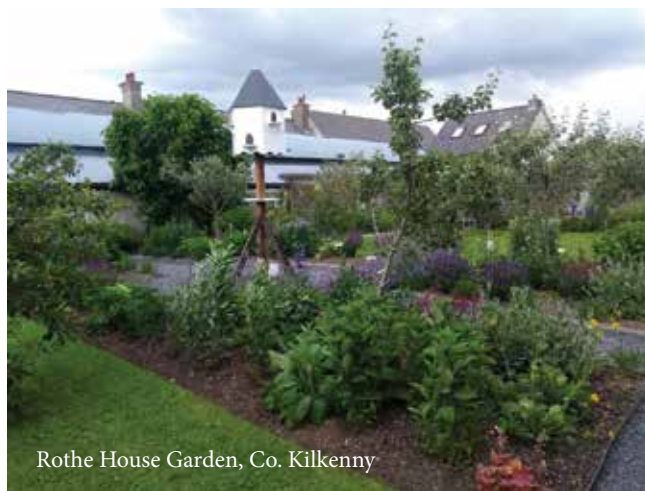
Rothe House Garden, Co. Kilkenny

with additional perennial planting has created an amazing feature in the centre of the orchard that we feel is a welcome addition in keeping visitor interest in the orchard area of the garden.