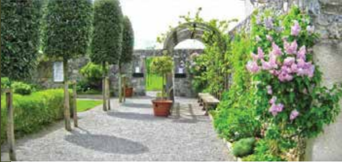
Rothe House Gardens