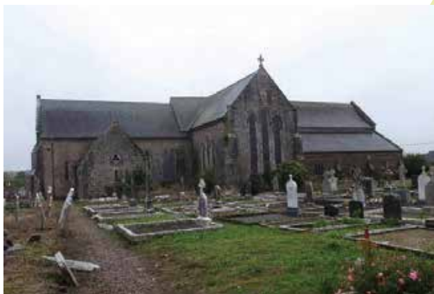
Cloyne Church of Ireland Cathedral

So, roughly 100,000 records have been uploaded in 2019 so far. Many more records are expected shortly, including the Roman Catholic registers for the parish of New Ross, County Wexford, as well as more Limerick records, so keep your eyes open for more updates! We will notify those on our mailing list when these records are uploaded and available, so make sure to register to our mailing list to keep abreast with new additions to www.rootsireland.ie !