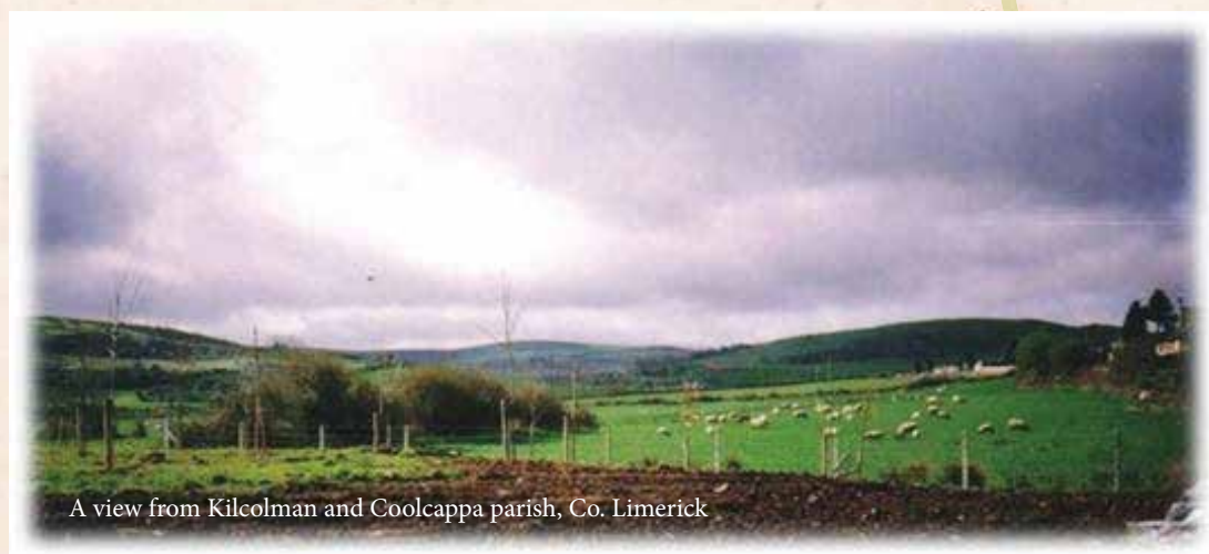
A view from Kilcolman and Coolcappa parish, Co. Limerick